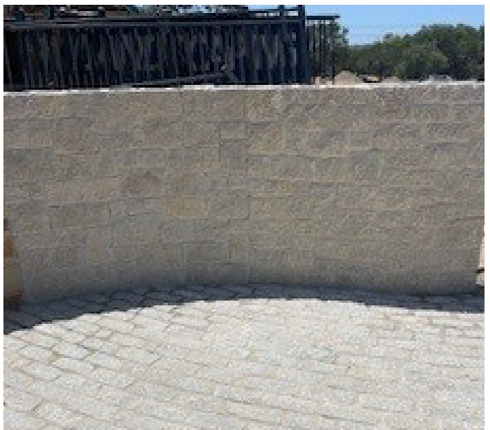
Timberland | 4" x 4" x Random Tumbled Edging