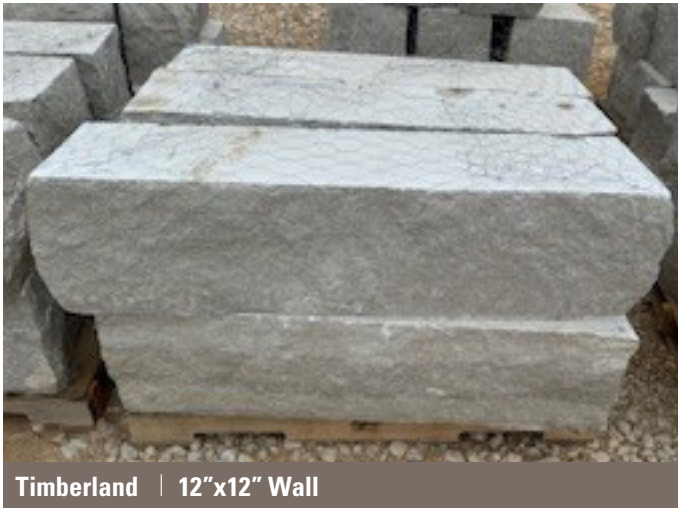
Timberland | 12"x12" Wall

The Timberland stone collection is known for its rich, earthy tones, making it a popular choice for rustic and southwestern-inspired outdoor designs to contemporary and traditional styles.