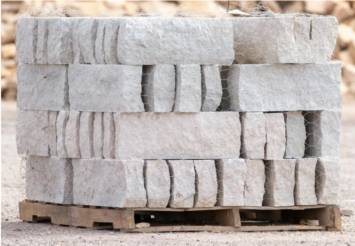
Timberland | Sawn Steps