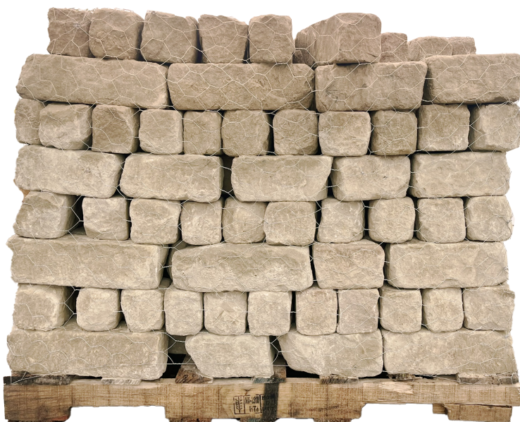
Timberland Tan | Tumbled Edging