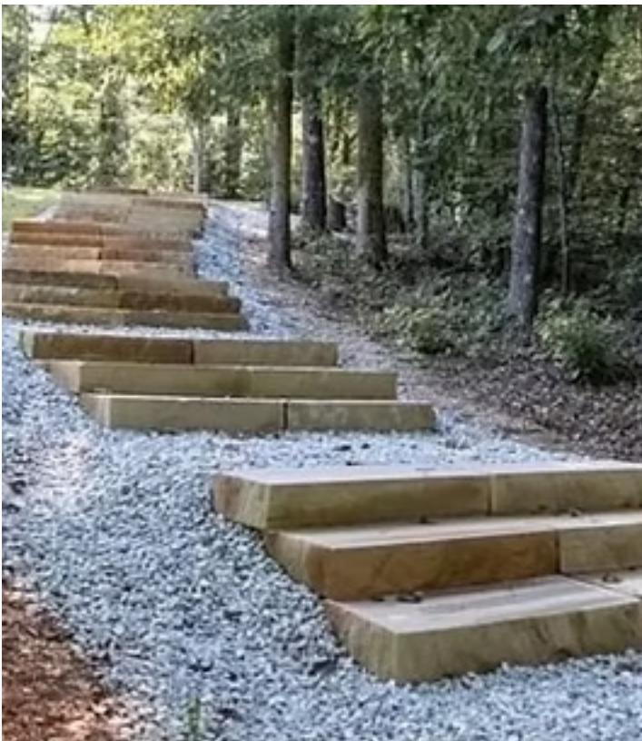
Timberland Full Color | Steps