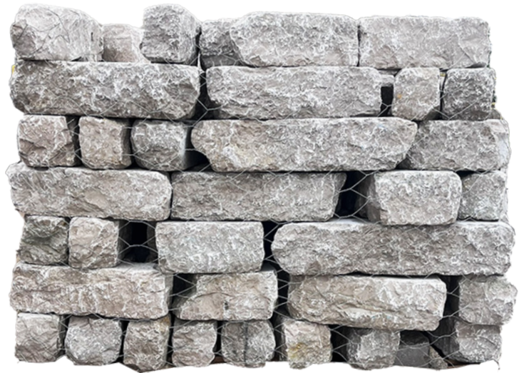
Timberland | Edging

Timberland natural stone collection is ideal for patios, walkways, retaining walls, and decorative features, and blends seamlessly with any native landscapes, providing a timeless and versatile look.