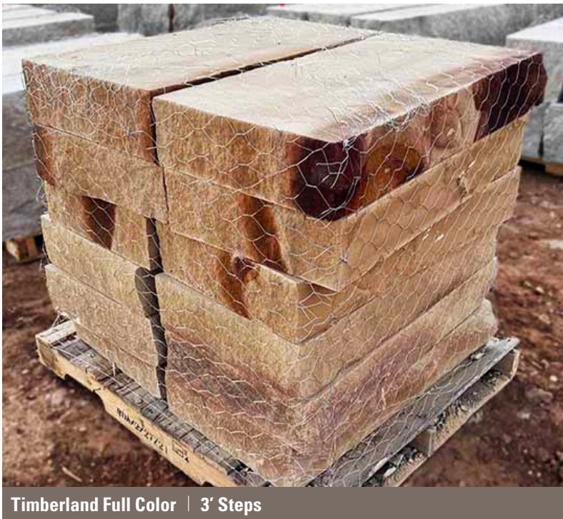
Timberland Full Color | 3' Steps

Known for its dramatic textures and deeper shades, including rust colors and browns, Timberland Full Color lends itself to colorful extention of the earth it sits on.