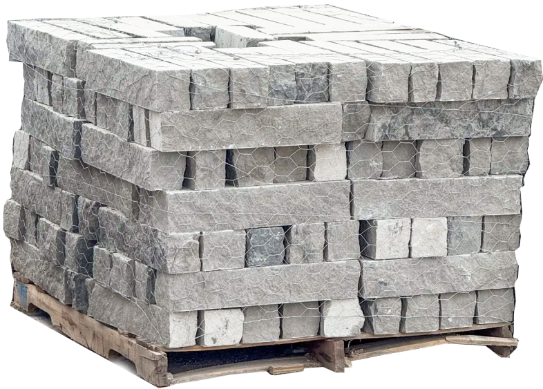
Timberland Charcoal | Sawn Steps