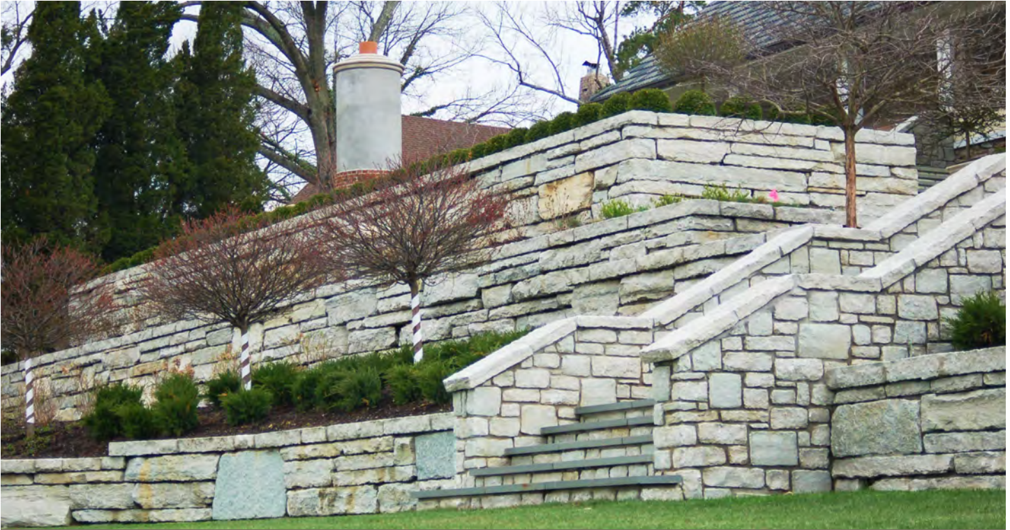
Canyon Gray | Outcroppings (Item #653-7, #653-12 & #644-LLT)