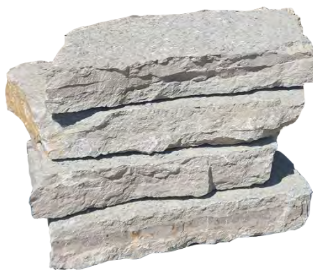
Canyon Gray 7" Natural Steps Item #851-2