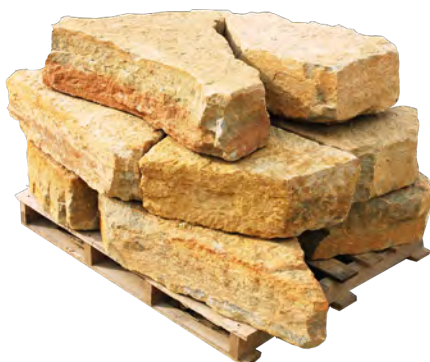
5" - 9" Thick Lil' Chunkies Item #260