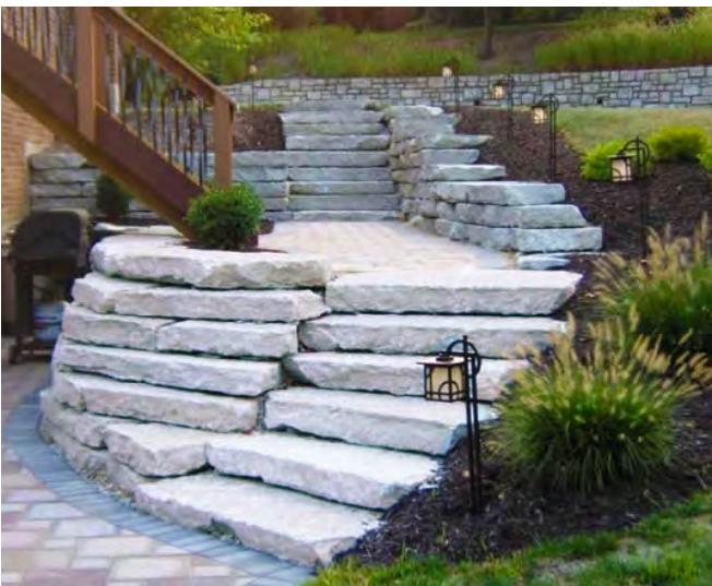
Canyon Gray | Natural Steps (Item #851-2) & 7" Outcroppings (Item #653-7)