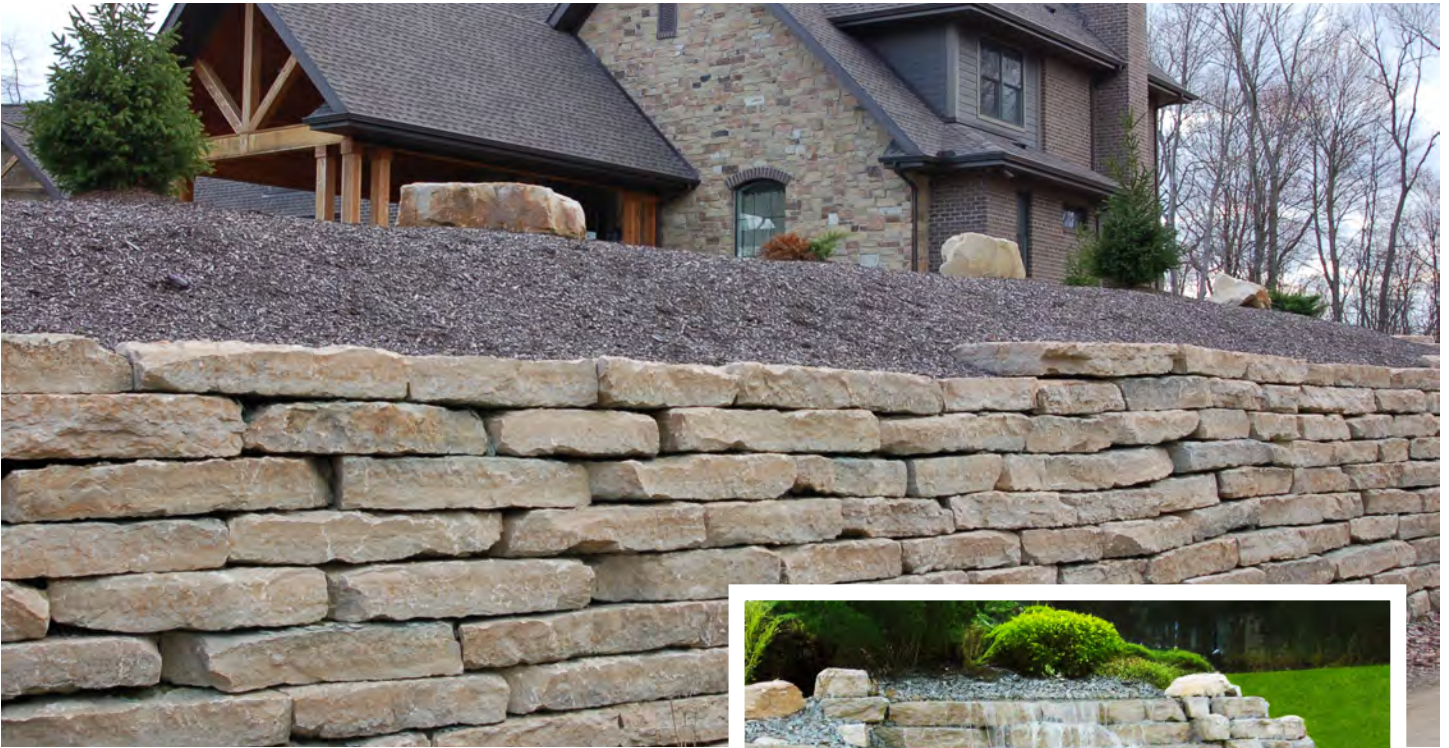
Rustic Buff Beige | Outcroppings Item #657-9B

Canyon Gray • Canyon Tan • Rustic Buff • Rustic Buff Beige