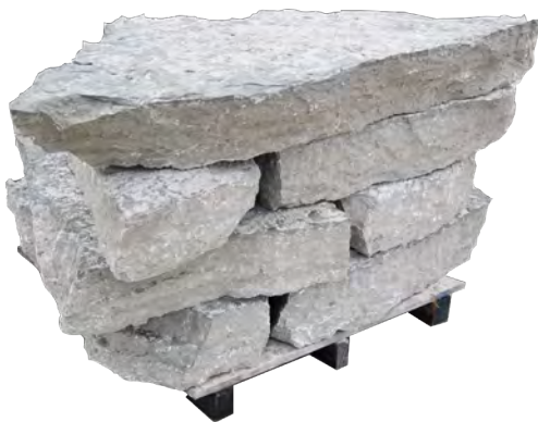
Canyon Gray 7" Outcropping Item #653-7

Snapped Steps have one snapped face providing you with the look of Cut Wall at a more affordable price.