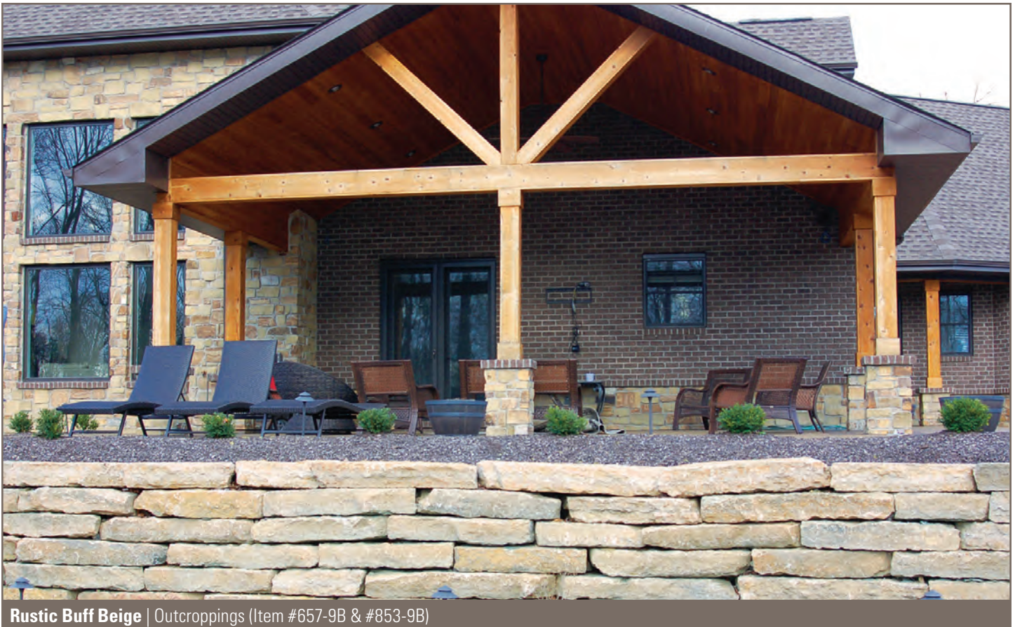
Rustic Buff Beige | Outcroppings (Item #657-9B & #853-9B)

Inch measurements listed in product name designate thickness of stone.