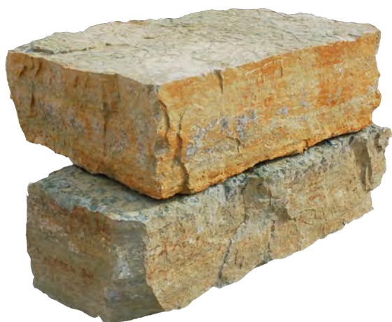
Rustic Buff 17" Natural Face Benches - Building Blocks Item #680

Known for its warm tones that range from golden yellow to light orange, Rustic Buff is ideal for landscape applications in thick cuts.