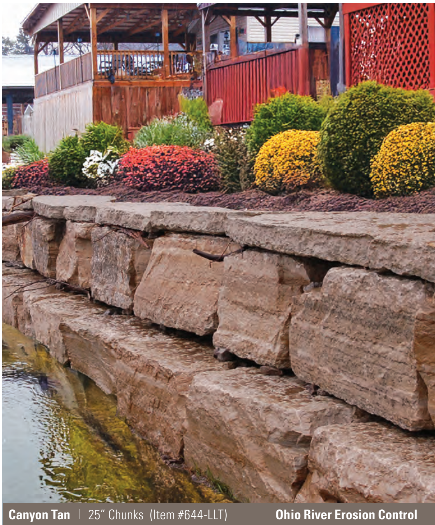
Canyon Tan | 25" Chunks (Item #644-LLT) Ohio River Erosion Control

Canyon Tan is available in outcroppings, slabs, accent boulders, and chunks for stream restoration and erosion control.