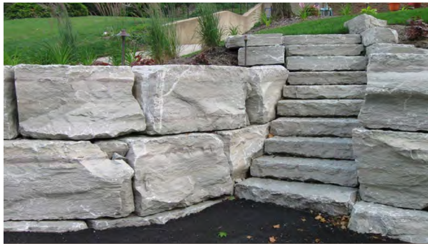
Canyon Gray 36" Natural Steps (Item #851-2) & Canyon Tan 25" Chunks (Item #644-LLT)

Canyon Gray is a very light gray to olive green stone that specializes in 7" slab materials, and is available in select wall stone, natural steps, flagging, outcroppings/slabs, chunks, as well as an array of cut and split products.