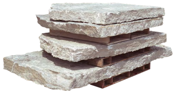
Canyon Gray Steps – Jumbo Natural Item #851-4

Canyon Gray and Canyon Tan products can be combined for full truck load orders.