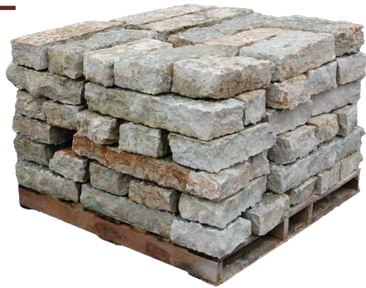
Rustic Buff Beige 5" x 8" Cut Drywall Item #152-5B

Rustic Buff Beige a lighter cream color with streaks of brown throughout.