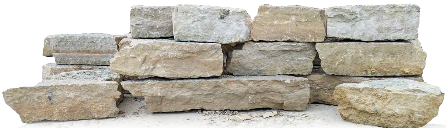
Rustic Buff Beige 12'' - 18'' Chunks Item #657

Rustic Buff and Rustic Buff Beige products can be combined for full truck load orders.