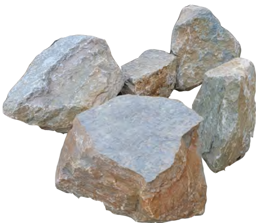
Canyon Tan Accent Boulder Item #644-BLT

Canyon Tan is a light tan limestone that specializes in outcropping and chunk materials.