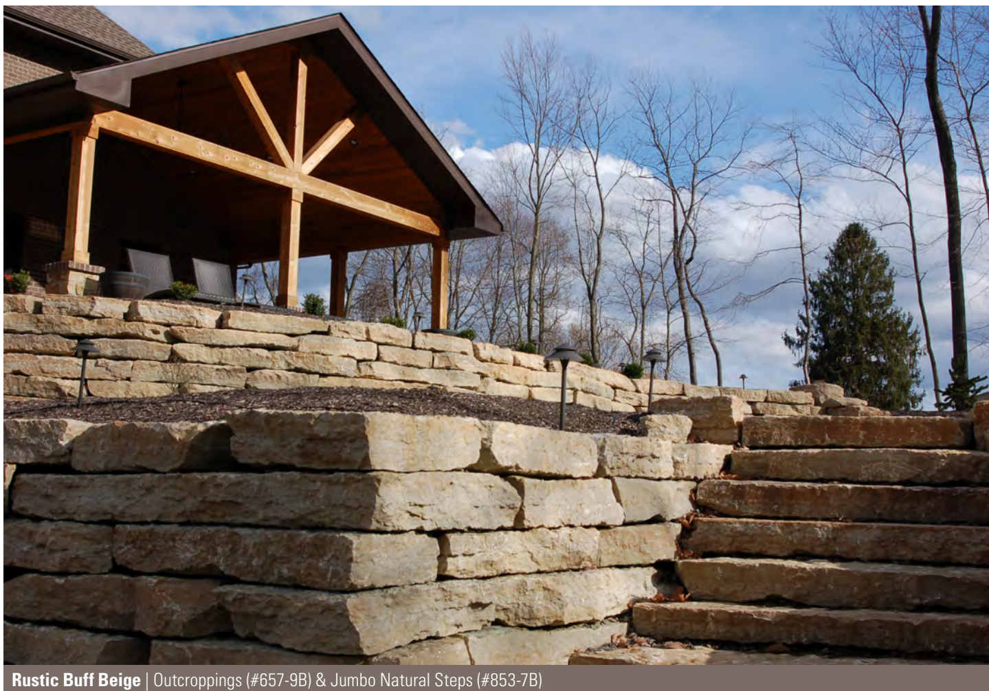
Rustic Buff Beige | Outcroppings (#657-9B) & Jumbo Natural Steps (#853-7B)

Rustic Buff and Rustic Buff Beige products can be combined for full truck load orders.