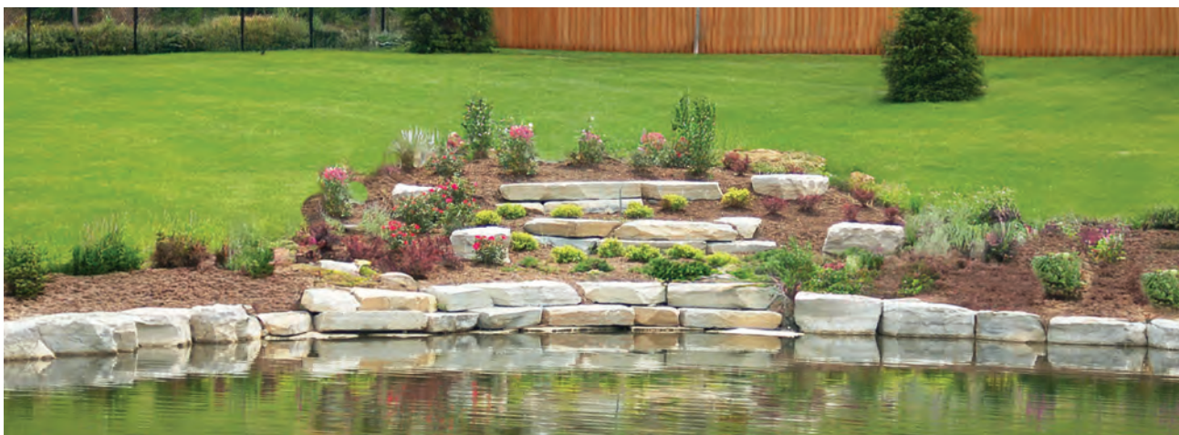
Canyon Tan | 25" Chunks (#644-LLT) & Outcroppings (#653-10T)

Applies to full trailer load orders (23-24 tons). No discounts or other promotions can be applied. Freight charges from the quarry apply.