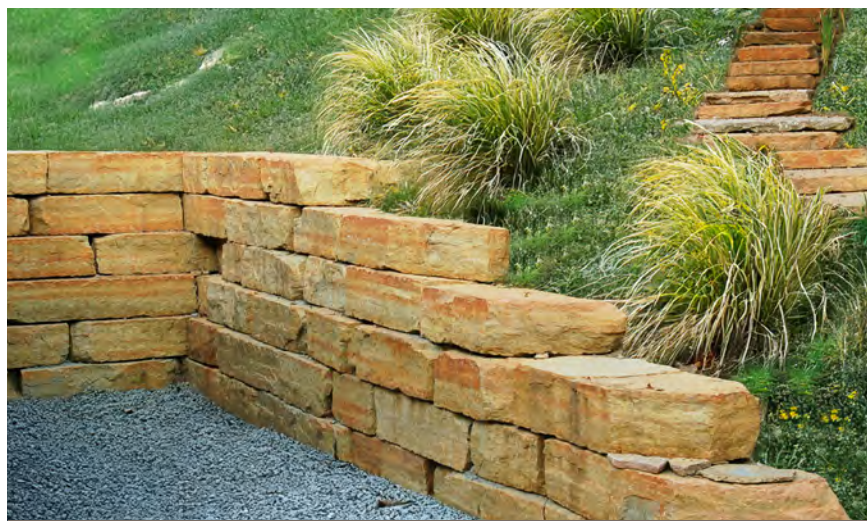
Rustic Buff | 16" Chunks (Item #655) & Benches (Item #680)