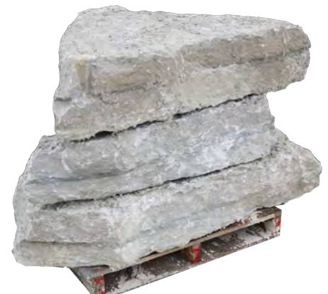
Canyon Gray 11" Slabs Item #653-12