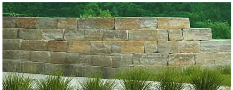
Rustic Buff | 17" Benches (Item #655) & Chunks (Item #680)