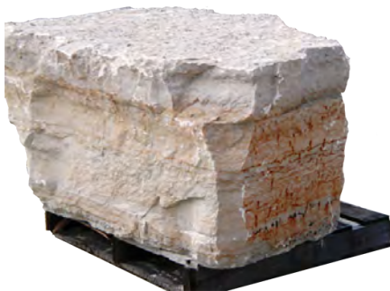
Canyon Tan 25" Chunks Item #644-LLT Also available in 20" (#644-LL2T)