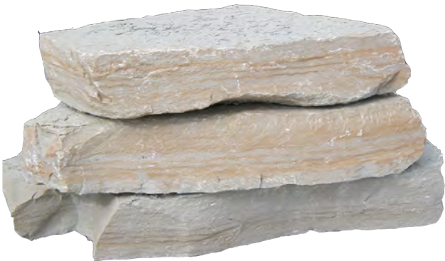
Canyon Tan 9" - 10" Outcropping Item #653-10T

Canyon Tan is available in outcroppings, slabs, accent boulders, and chunks for stream restoration and erosion control.