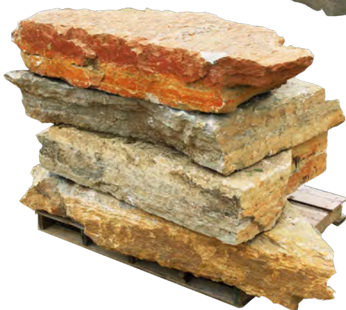
Outcropping & Slabs See chart for variations.