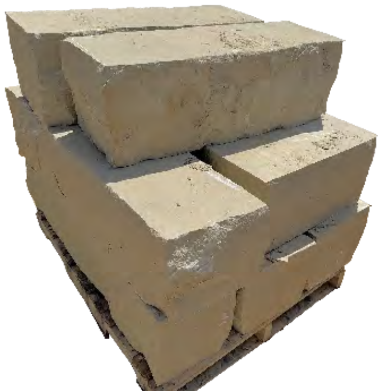
Timberland Tan | 12" x 12" Sawn Wall

Known for its rich, earthy tones, the Timberland Tan stone collection is a popular choice for rustic and Southwestern-inspired outdoor designs to contemporary and traditional styles.