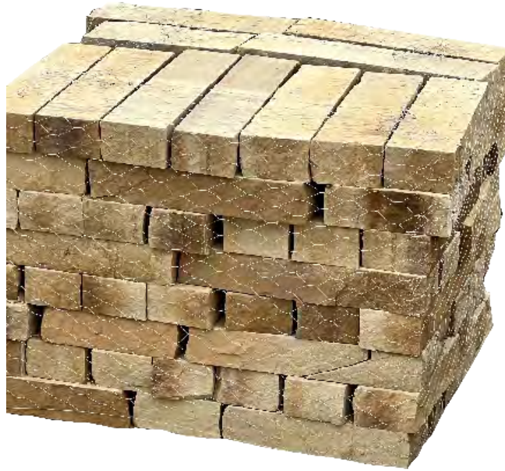
Timberland Full Color | 4" x 8" Drywall

Known for dramatic textures and deeper shades of rust and browns, the Timberland Full Color products lend themselves to a colorful extension of the earth it sits on.