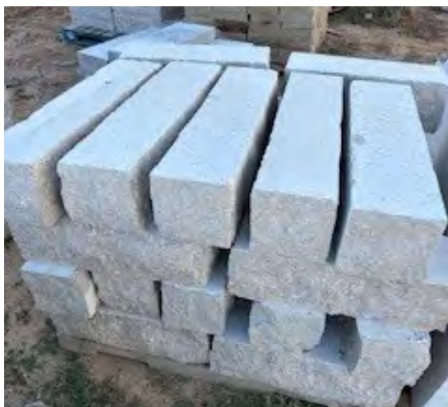
Timberland Gray | 8" x 8" Drywall