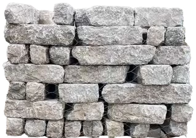
Timberland Gray | 4" x 4" x Random Tumbled Edging