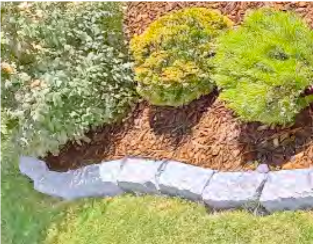
Timberland Gray | 4" x 8" Drywall Used as Edging