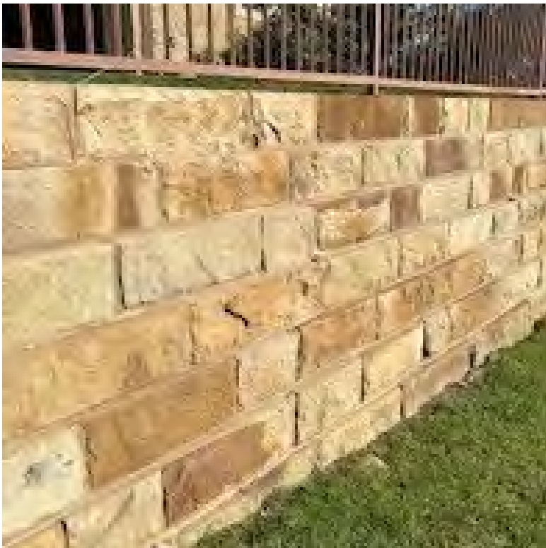
Timberland Full Color | 8" x 8" Drywall