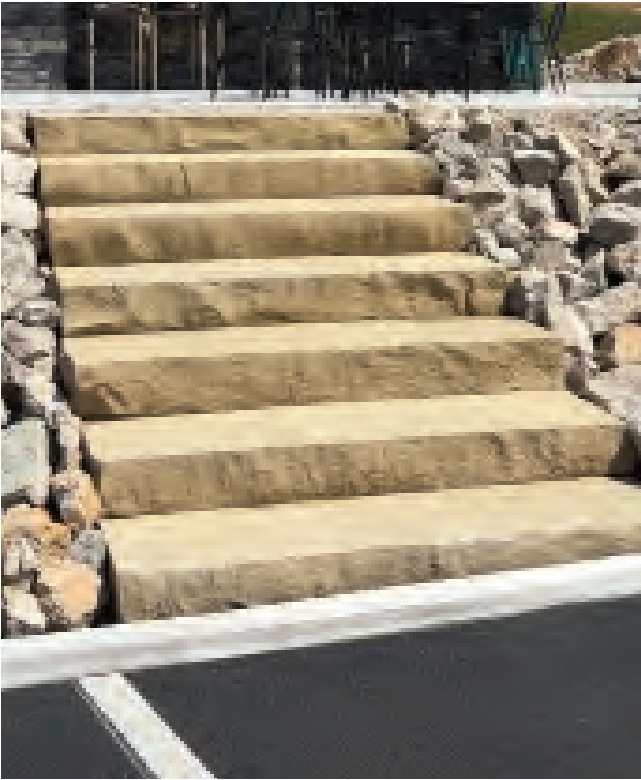
Timberland Tan | 5' Steps

Timberland Gray • Timberland Tan • Timberland Charcoal • Timberland Full Color