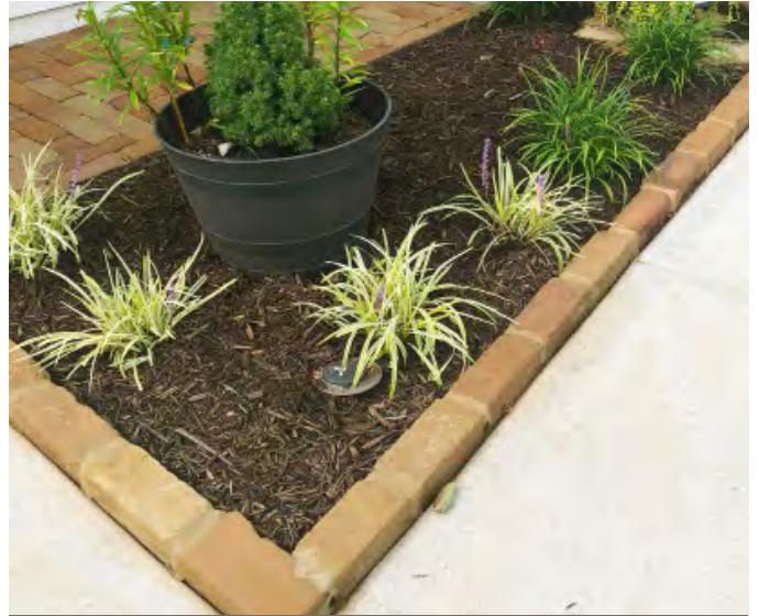
Timberland Full Color | 4" x 4" x Random Tumbled Edging