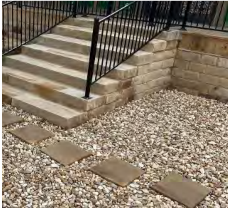
Timberland Full Color | 8x8 Drywall, Tumbled