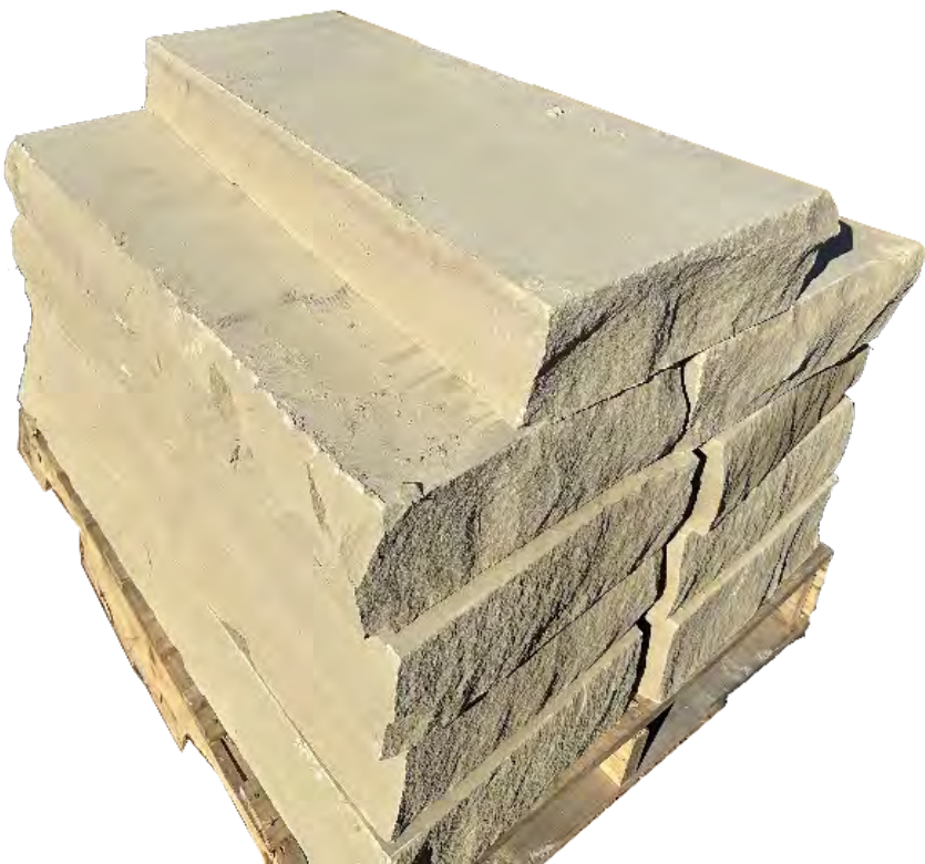
Timberland Tan | 3' Sawn Step (6" x 18" x 36")