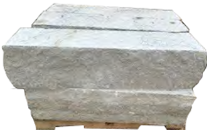
Timberland Gray | 12" x 12" Sawn Wall

Additional Products Used: Mountain Ridge Dimensional Sawn Face applied to the column.