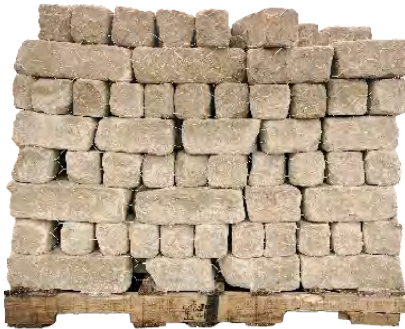
Timberland Tan | 4" x 4" x Random Tumbled Edging

Choose from the warm grays swirled with slight variegates of tan in the Timberland Gray line, or the predominantly tan stone swirled with creams and golds found in Timberland Tan stones.