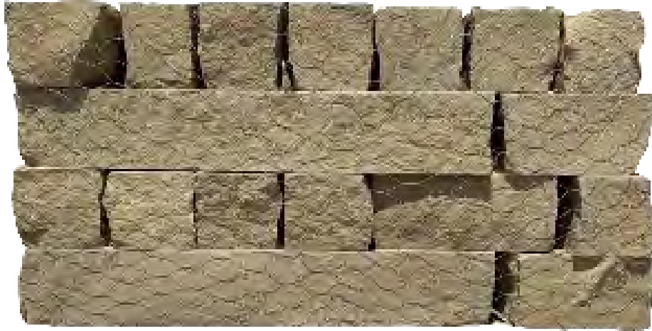
Timberland Tan | 4" x 4" x Random Edging

Choose from the warm grays swirled with slight variegates of tan in the Timberland Gray line, or the predominantly tan stone swirled with creams and golds found in Timberland Tan stones.