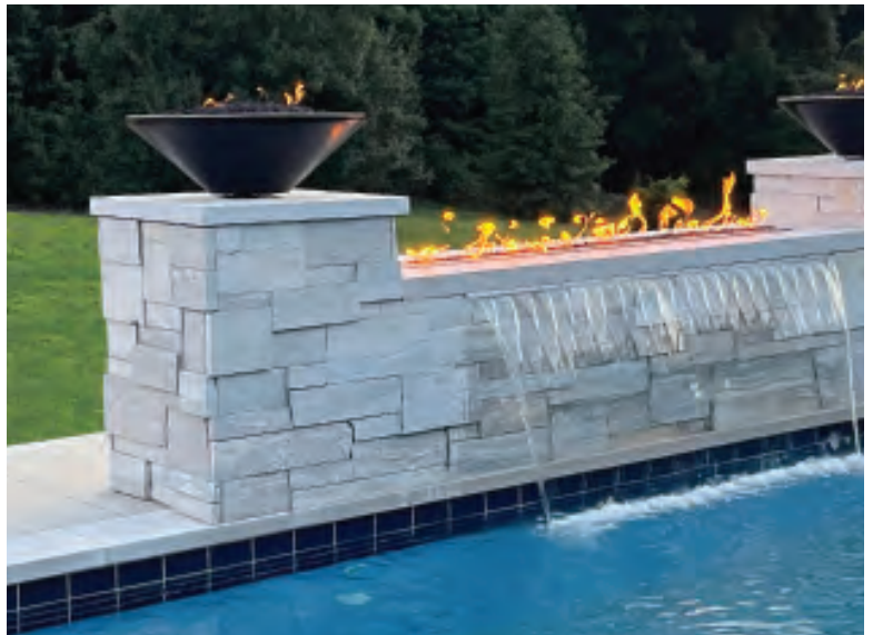
Timberland Gray | Custom Cut Wall Caps