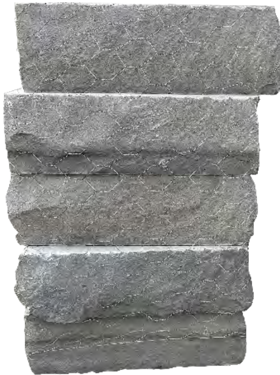
Timberland Charcoal | 3' Sawn Steps

With its deep tones, Charcoal-colored natural stone steps offer a clean architectural look that adds a striking contrast and modern elegance to outdoor spaces.